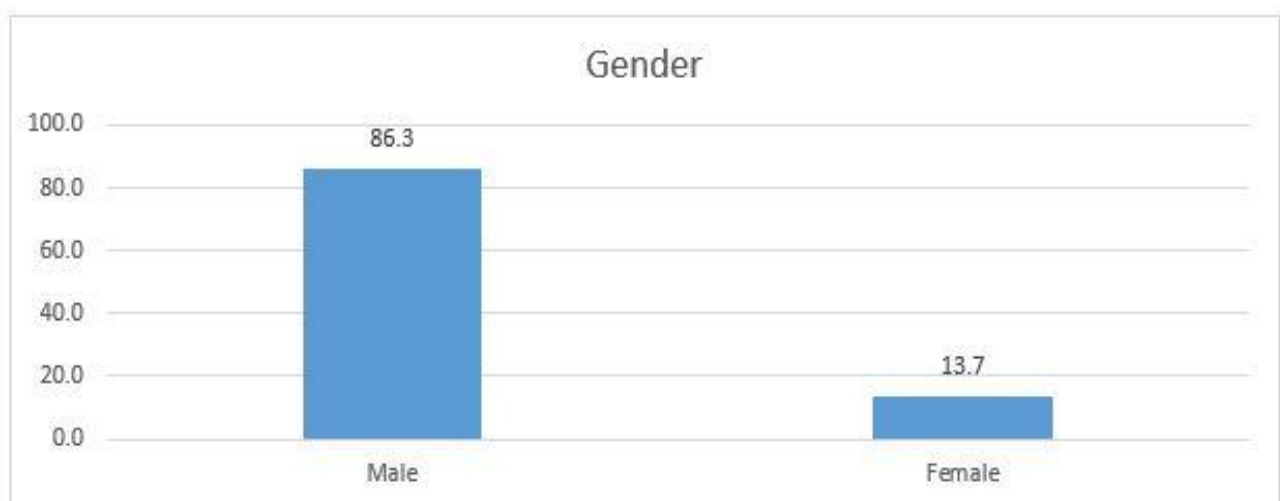
Figure 1: Gender of Participants.

The findings of the study revealed that 86.3 percent were male while 13.7 percent were female which showed that majority of the students in the ICT sector are male as shown in the Figure 1 below.